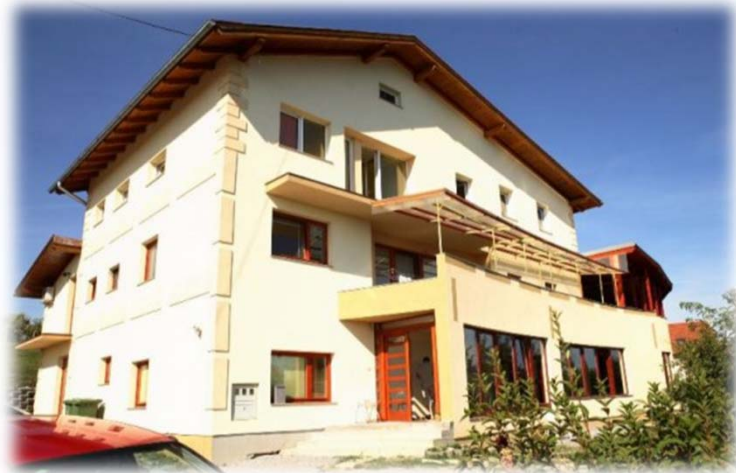
Zagreb Temple 1000 sqm