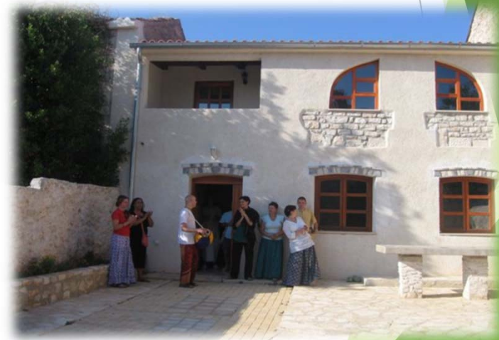
Pula Temple 120 sqm